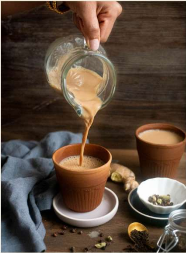
Making your favourite Tea