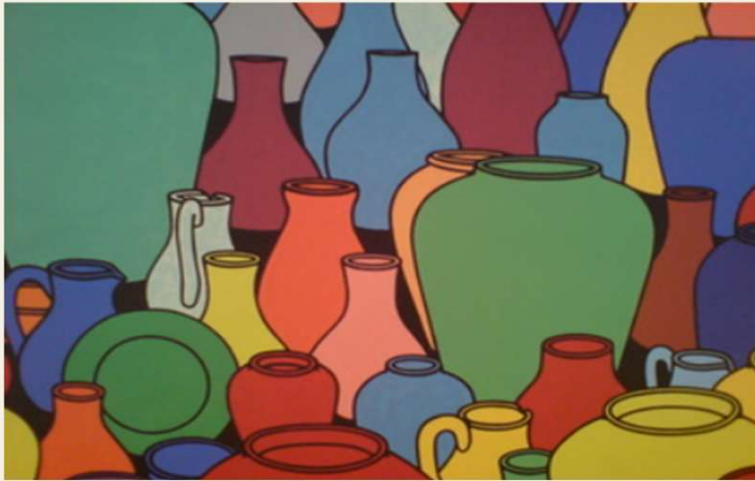
Quality vs Quantity